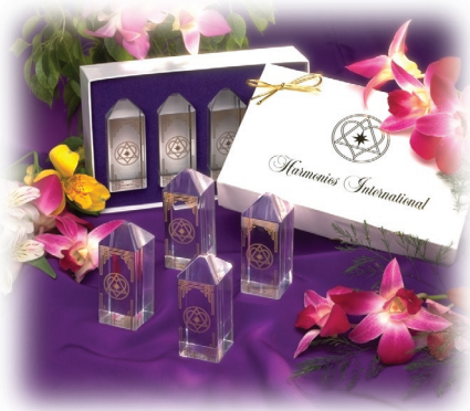
Actual Size ea. piece 3" x 1 1/4" sq.

Live in an environment of peace and harmony - anywhere, anytime. Negative energies are transmuted and positive energies enhanced.